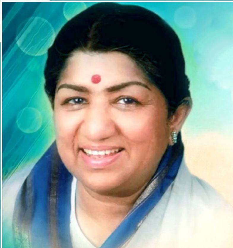
LATA MANGESHKAR, Singer