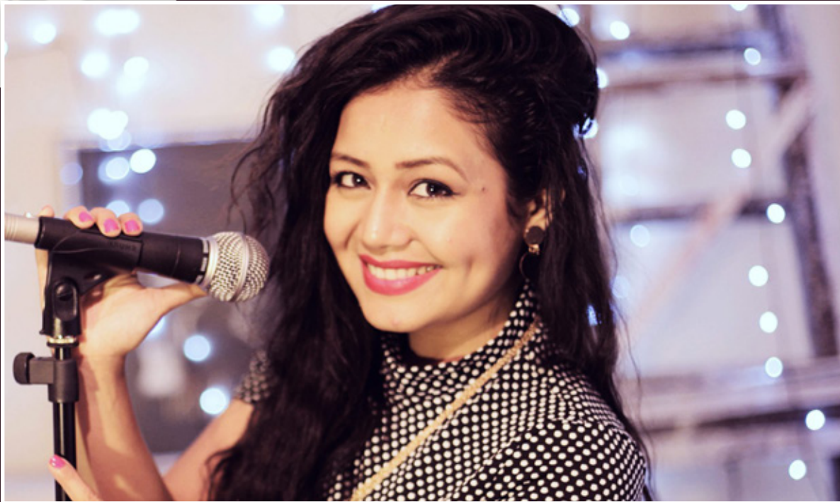
NEHA KAKKAR, Singer

The queen of Bollywood's billboard, Neha Kakkar writes the pitched-perfect story of rags to riches inspiring many to follow her suit. An ordinary young girl from a simple family, she was not born with a silver spoon, but with her grit, determination and hard work she climbed the glittery golden ladder of Bollywood to stand at the crest of name and fame. The diva has gained immense popularity through her unique voice and sensational songs. Name any chartbuster song of this decade and there is a fair chance that Neha Kakkar is the voice behind!