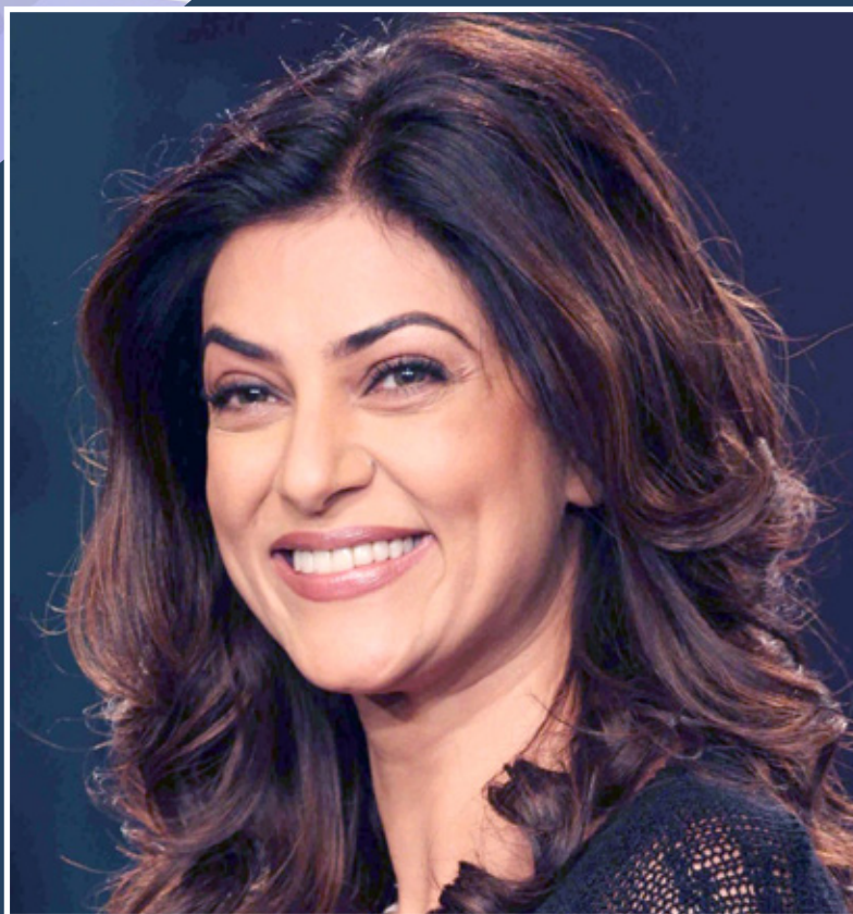
SUSHMITA SEN, Actress Bollywood

Speaking of her personal life, she never waited for a man. If she wanted a diamond, she went and bought it herself. She was a feminist even before it was too cool to be one. She further broke conventions when she fell in love