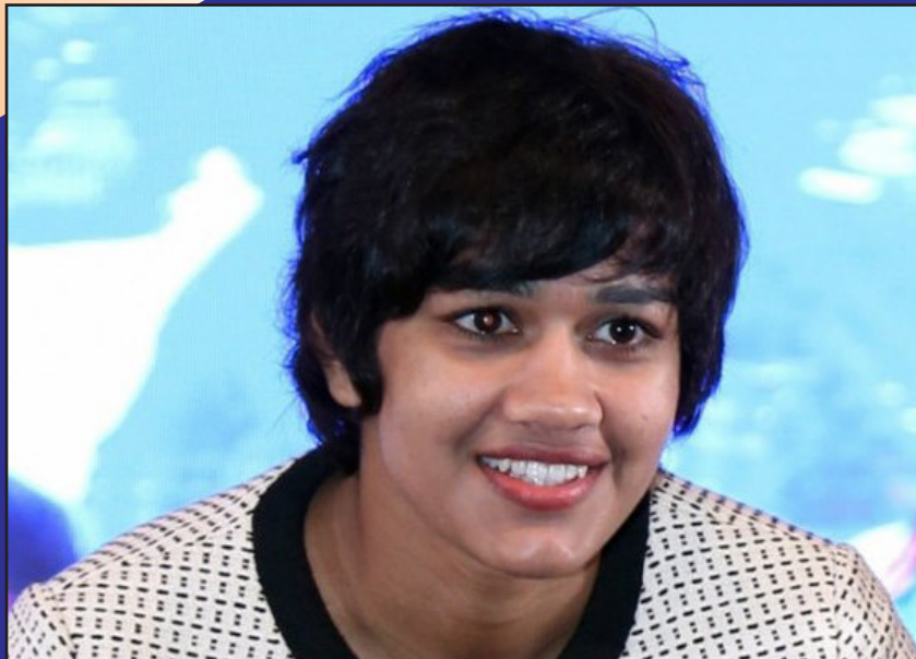
BABITA KUMARI PHOGAT, Wrestling

Babita Kumari Phogat, the gold medallist in Commonwealth Games, hails from the first family of wrestling in India. Being born in a time and place, when girl child was seen as a bane, the Phogat sisters had to wrestle their way to uproot this perception. For the Phogats, it was not just a fight in the court, but they had to break through many conservative shackles and hostility of the society. With an unflinching faith and undeterred dedication, Babita Phogat has not only made her father and guru Mahavir Phogat proud by winning gold for the country, but she has stood tall as an inspiration for many young girls especially those hailing from rural India by etching her name in golden letters in the glorious books of achievements by the Indian woman.