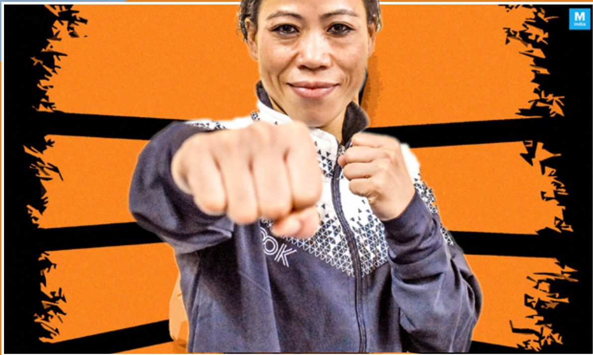
MARY KOM, Boxing Champion