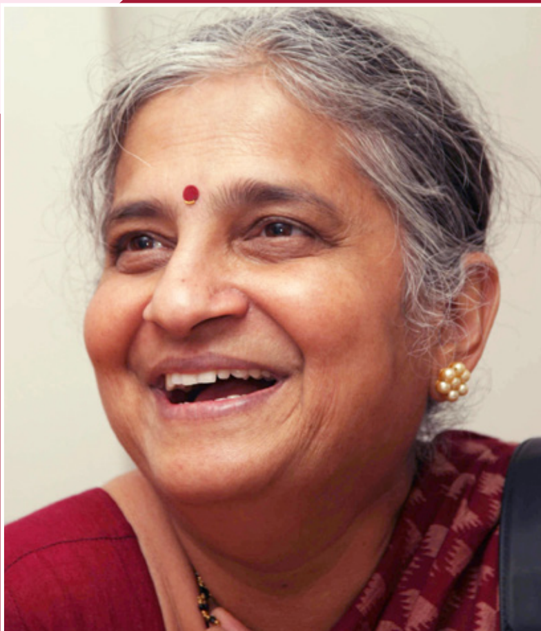
SUDHA MURTHY, Chairperson of the Infosys Foundation

Sudha Murthy, the chairperson of the Infosys Foundation, a brilliant engineer, homemaker, author and philanthropist is an eminent force of change in Indian society. A feminist in true spirit, Sudha Murthy has empowered women by awakening the women to get education, public hygiene, and equal rights. She has played an instrumental role in shaping a modern society that has a more inclusive approach towards poverty alleviation and uplifting standards.